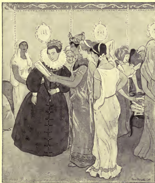
“ ‘ THE COMMITTEE ON TREACHERY IS READY TO REPORT ’ ”